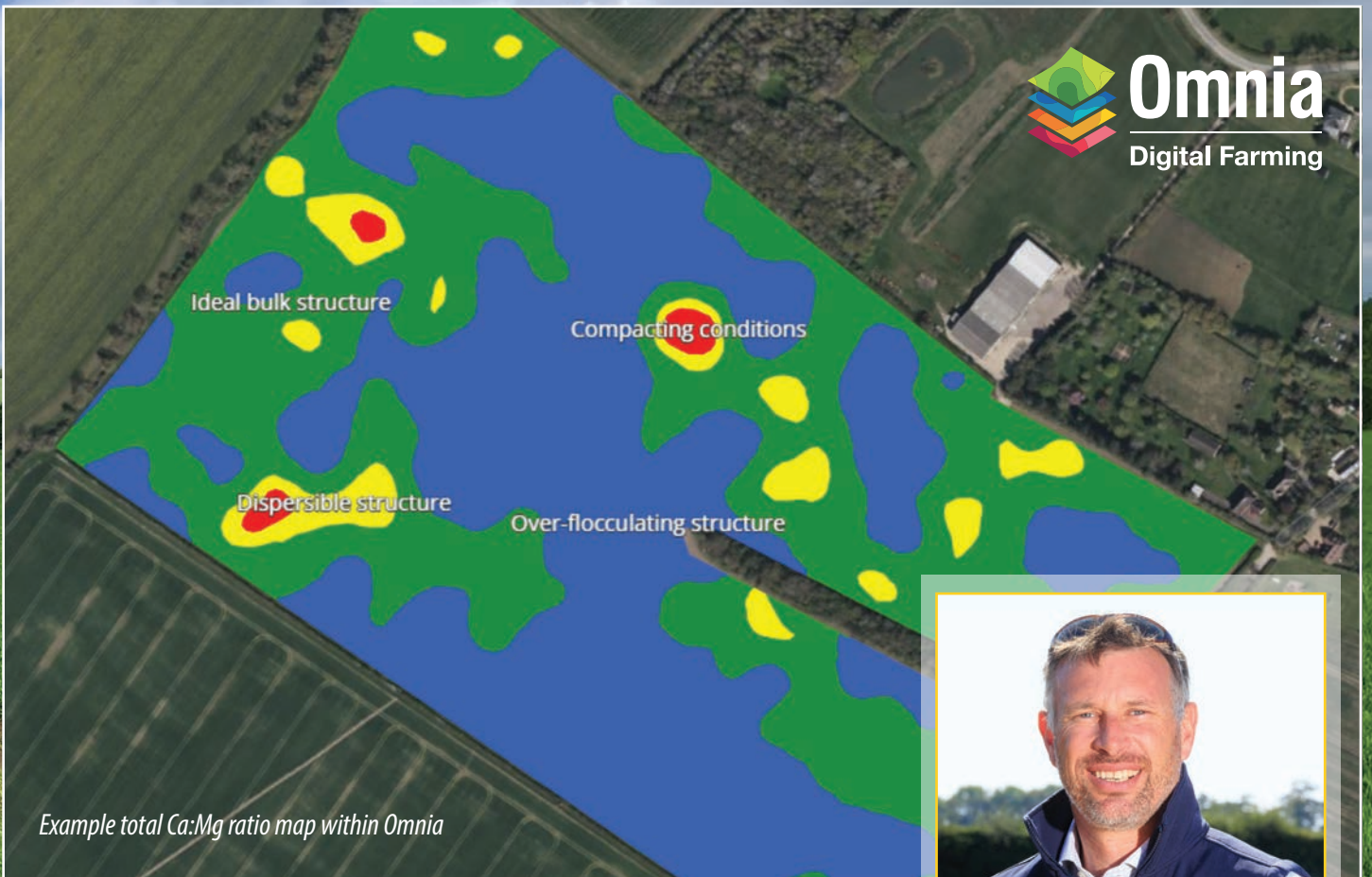
Example total Ca:Mg ratio map within Omnia